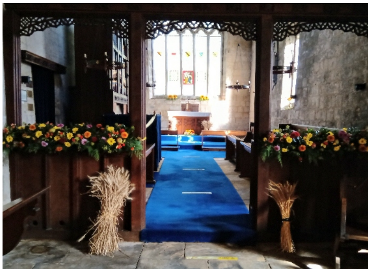
St. Mary's Church always looks beautiful at Harvest Festival